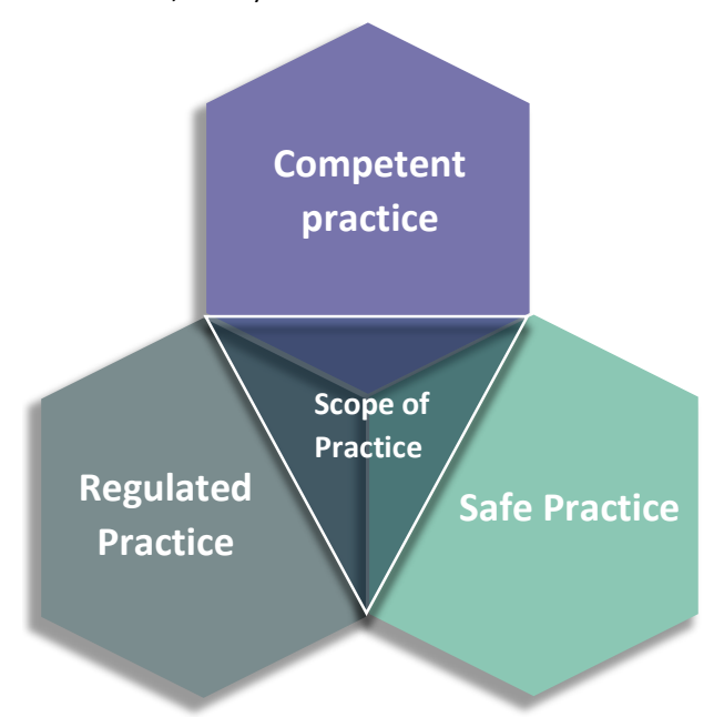
Diagram 1: Scope of Practice for Registered Counsellors

Consideration should be given to each facet for a complete view of counsellors' professional